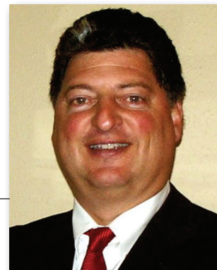
By Joe Salpietra

Proactive grease management for your kitchen exhaust system.