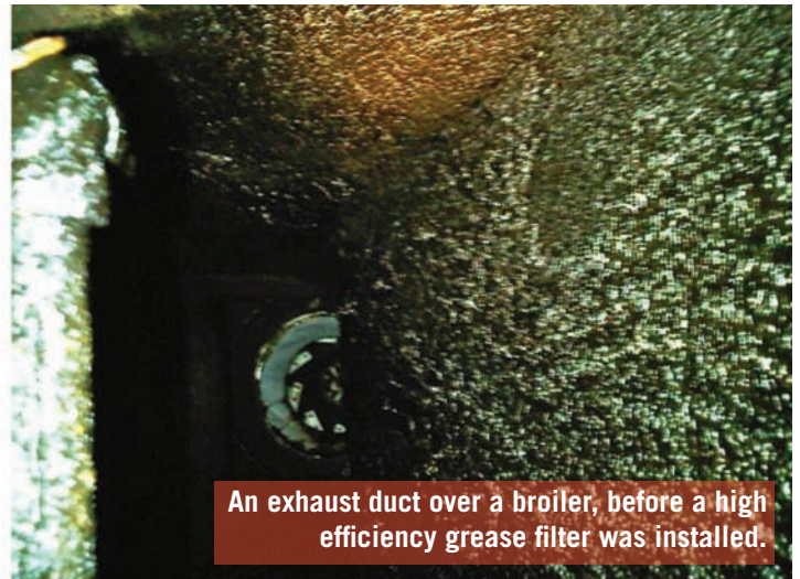
An exhaust duct over a broiler, before a high efficiency grease filter was installed.

This article is intended to provide additional information on the high efficiency grease filters and a new technology used for proactive grease management for the commercial kitchen exhaust hoods, which was the subject of an article that was published in the December 2009/January 2010 edition of Restaurant Facility Business . These high efficiency grease filters were introduced into the market in the last 5 to 10 years to capture and remove a much higher percentage of the grease particulates generated by the cooking appliances, prior to it entering the kitchen exhaust system, resulting in much less accumulation of grease in the exhaust system, and improved fire safety. Most of these filters are used as primary grease filters in the exhaust hoods, are made of metal, are of a single-stage or multi-stage design, use baffles or other construction to remove grease, and require regular cleaning.